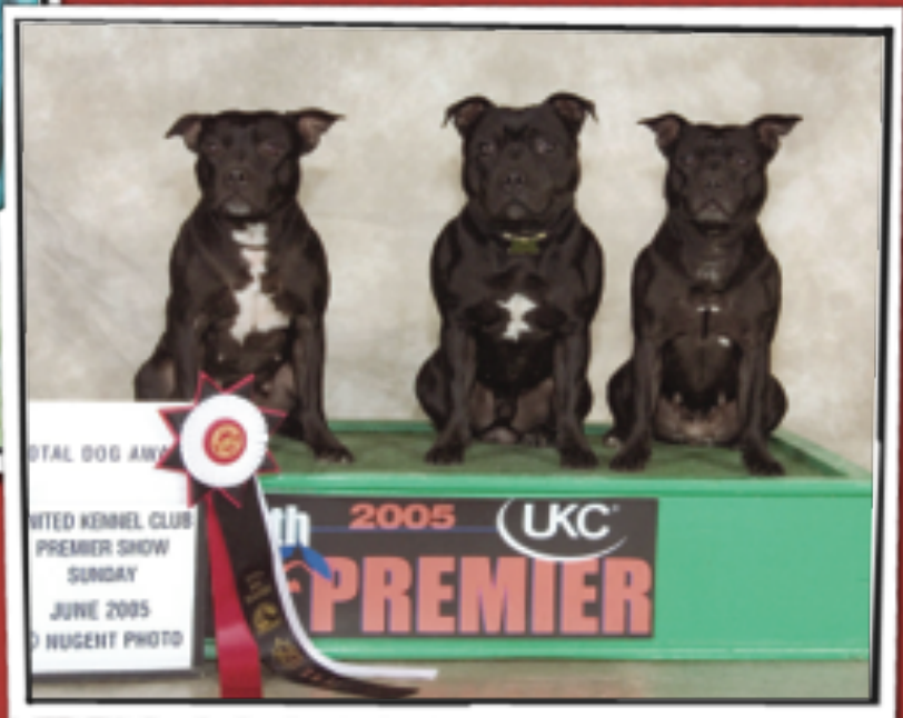
DITTO, ET, HONOR