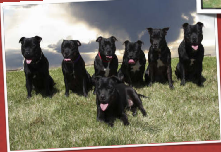
SHE GREW BORED EASILY. IF THERE WAS SOMETHING NEW TO TRY, SHE DID.