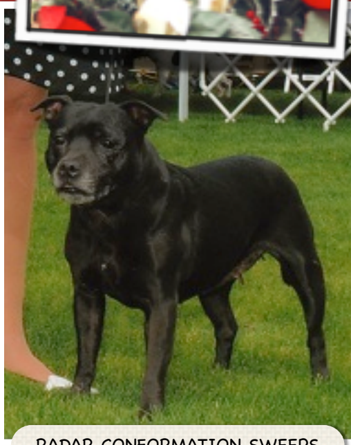
RADAR CONFORMATION SWEEPS