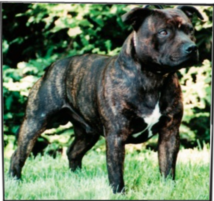
CH. LINESTAFF COACHMAN