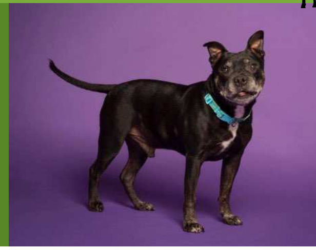
Dempsey - July 23rd, 2016 Adopted - August 11th, 2016

Dempsey entered into rescue on July 23rd of 2016. His heartbroken owner had become increasingly disabled and was very worried that one day his own health would require a higher level of care and that