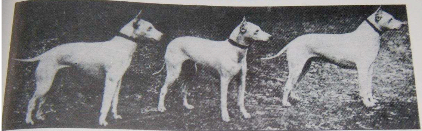
One of the very few KC registered breeds to become extinct since dog shows started, the White English Terrier. These are three of the last champions. Queen, Silver Blaze and Morning Star, from 80 or more years ago.