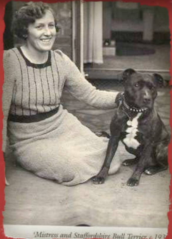
Mistress and Staffordshire Bull Terrier. c. 193