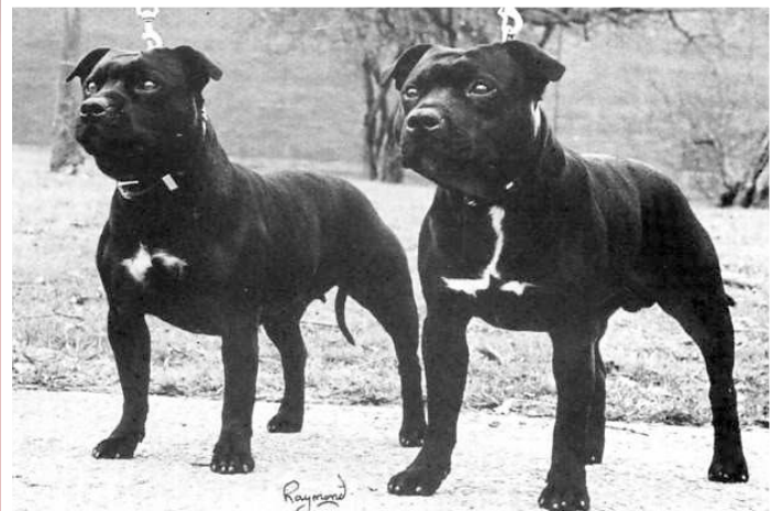
CHAMPION BLACK ICE Desperado Cossack ex Wilko's Evil Edna